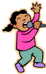
Sing or Listen to Music