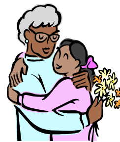
Get a Hug